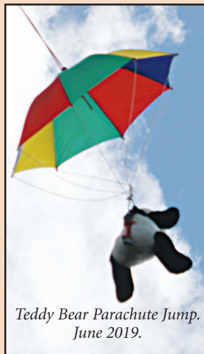
Teddy Bear Parachute Jump. June 2019.