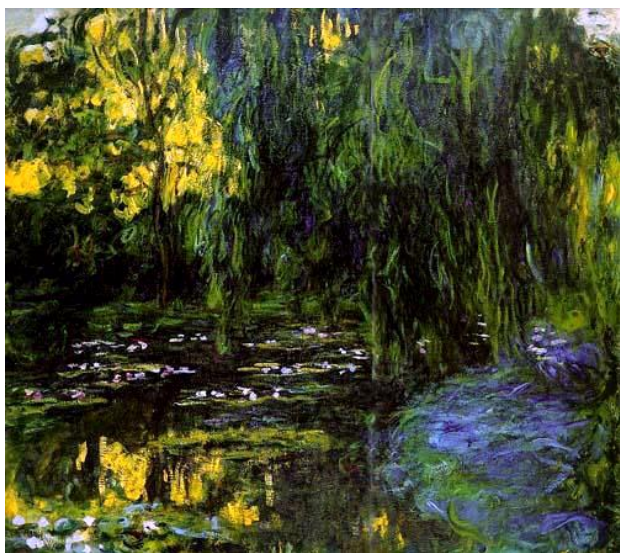
Monet, Claude, 1840-1926. Water-Lily Pond and Weeping Willow, from Art in the Christian Tradition https://diglib.library.vanderbilt.edu/act-imagelink.pl?

The wicked are not so, but are like chaff that the wind drives away. Therefore the wicked will not stand in the judgement, nor sinners in the congregation of the righteous; for the Lord watches over the way of the righteous, but the way of the wicked will perish.