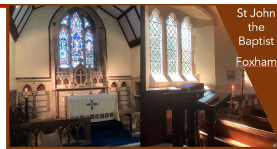
St John the Baptist Foxham